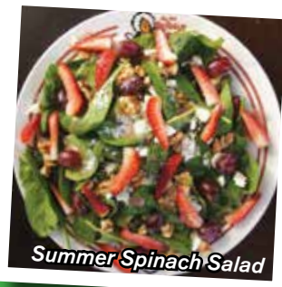
Summer Spinach Salad