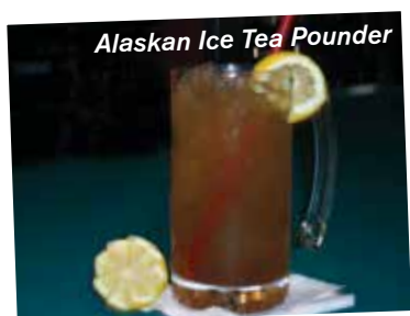
Alaskan Ice Tea Pounder

A 25 oz. powerhouse proudly made with Tito's, Bacardi, Tanqueray, José Cuervo, Triple Sec Liqueur, Sweet and Sour and Coca-Cola. *Limit two (2) per customer. $16 Add strawberries $1