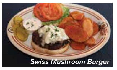
Swiss Mushroom Burger