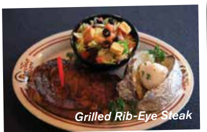
Grilled Rib-Eye Steak

One full pound hand cut with just a touch of tex-mex flavor. $30