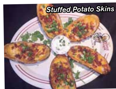
Stuffed Potato Skins

Five spuds deep fried and topped with Cheddar, bacon bits and chives. Served with sour cream. $15.25