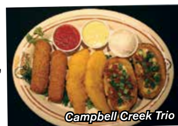
Campbell Creek Trio

Potato skins, Mozzarella sticks, and chicken strips. $15.25 (No substitutions).