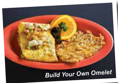
Build Your Own Omelet

Choose 3 for $13 (Each additional $1.50).