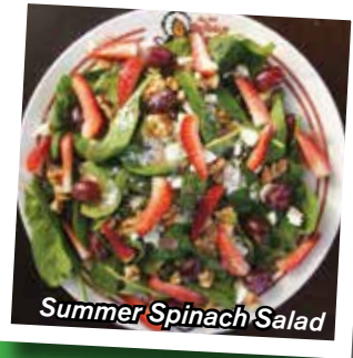
Summer Spinach Salad