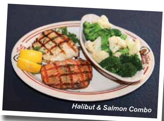
Halibut & Salmon Combo

A fillet of each, the best Alaska has to offer. $29